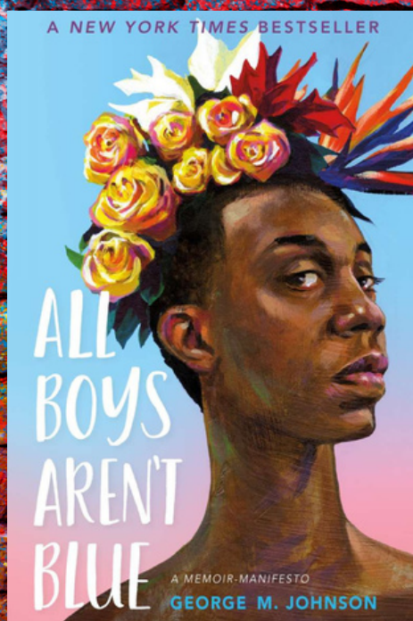
All Boys Aren't Blue by George M. Johnson